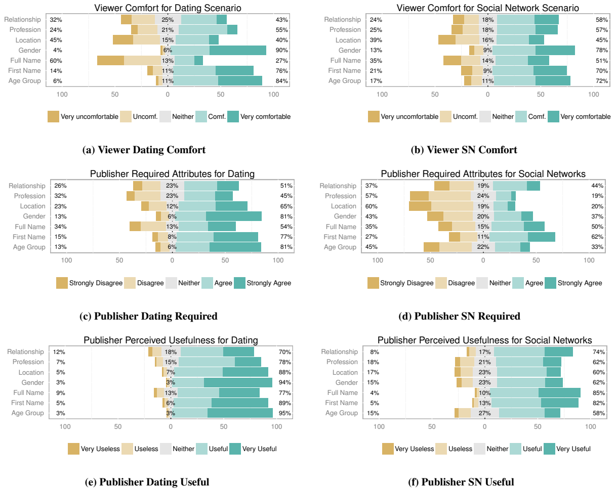
Figure 2: For the dating and social networking (SN) scenarios how comfortable viewers were with sharing attributes (a,b), how much publishers felt the data should be required to be shared (c,d), and how useful publishers found the data (e,f).

ent by the B-H correction, albeit with a small effect size. The difference between comfort levels in sharing Location and Profession is significant with a medium effect size. Thus, we advise designers of such systems that it is useful and acceptable to share Relationship , and even more acceptable to share Profession (the difference is statistically significant with a low effect size).