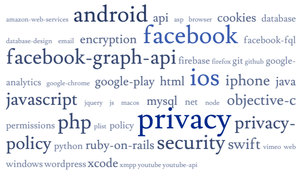
Figure 3. Top 50 most commonly used tags by users (SO-privacy).